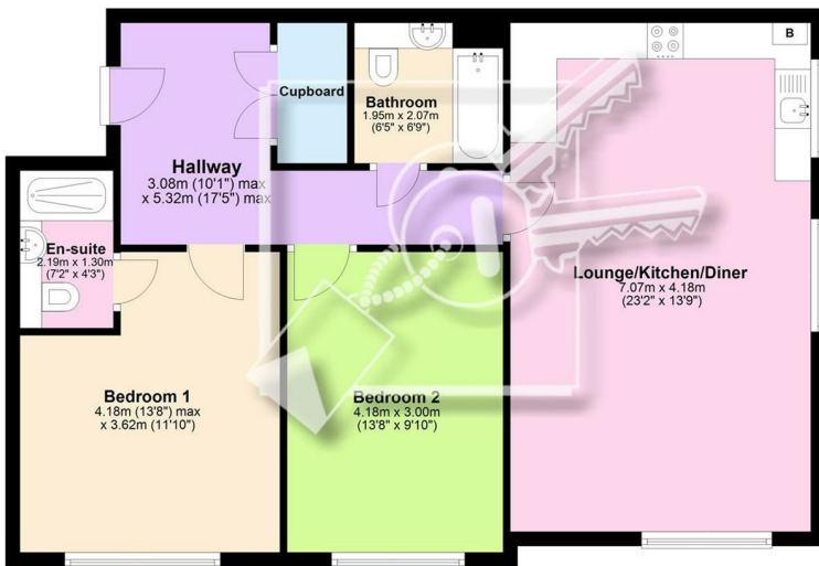
Floor plan is for illustrative purposes only. Plan produced using PlanUp.